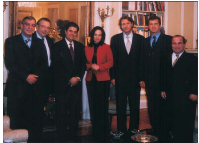
HON. ANNA DIAMANDOPOLOU, a representative of Greece to the European Union visiting New York, met with the Executive Board of the Chamber.