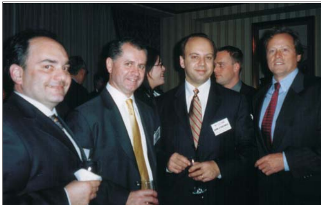
Speakers and participants enjoy time for networking during the post-conference reception sponsored by Healy & Baillie LLP and Jacq. Pierot, Jr., & Sons, Inc.