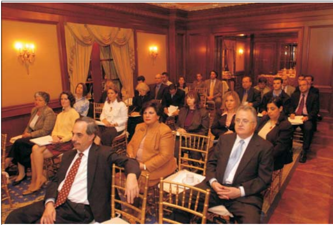
SEMINAR ON THE SUBJECT OF WEALTH PLANNING at the St. Regis Hotel was hosted by the Hellenic-American Chamber in cooperation with The Hellenic American Women's Council.