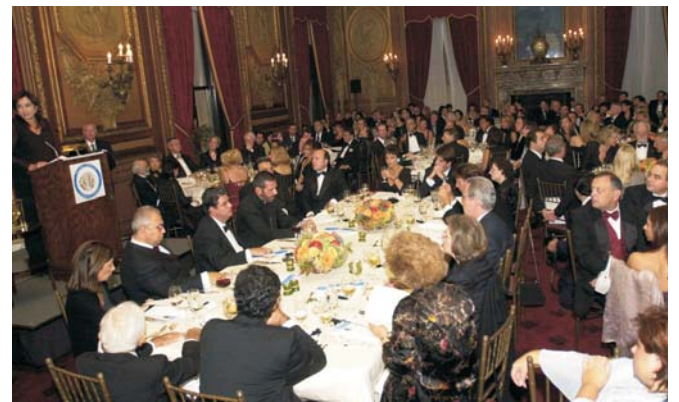
AT THE METROPOLITAN CLUB OF NEW YORK, the 2003 Hellenic-American Chamber's annual dinner dance was the most successful ever, with over 350 guests in attendance to greet Mayor Bakoyianni.

At the Annual Dinner Dance of the Chamber at the Metropolitan Club on October 17, we had the privilege of honoring the the Mayor of Athens, Hon. Dora Bakoyianni, as our 2003 Person of the Year.