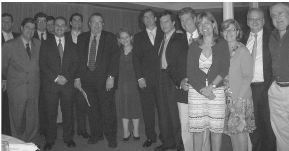
Members and directors gathered on June 6 for the Hellenic-American Chamber of Commerce Annual Meeting, Elections to the Board of Directors, and Elections of President, Chairman and Executive Committee.