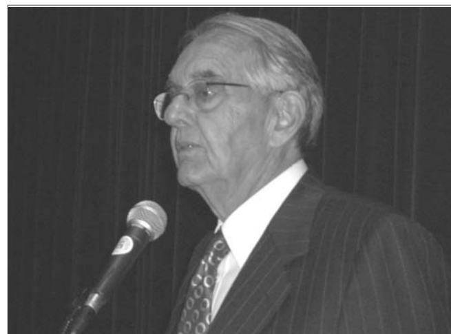
Peter Peterson, Senior Chairman of The Blackstone Group, addresses the Hellenic-American Chamber of Commerce and Hellenic American Bankers Association at the Harvard Club.