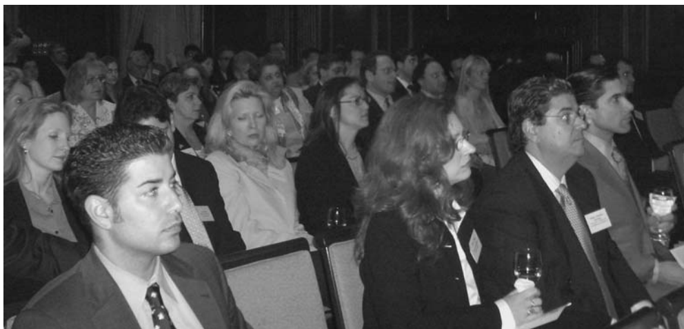
More than 120 members attended the May 17 reception at the Harvard Club to hear Stephen Ross' views and insights on the New York real estate markets.

July 11, 2005 ~ HACC and the Greek Trade Office in New York hosted a splendid reception at The Battery Gardens in honor of the Greek exhibitors at the 2005 Fancy Food Show at Javits Convention Center. Greek companies appreciated the opportunity to meet and exchange ideas with local Greek Food Importers.