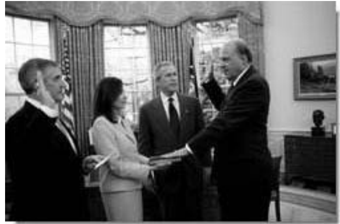
White House Chief of Staff Andrew Card swears in John Negroponte as the first Director of National Intelligence as President George W. Bush looks on Thursday, April 21, 2005, in the Oval Office. Dina Powell, Assistant to the President for Presidential Personnel, holds the Bible.