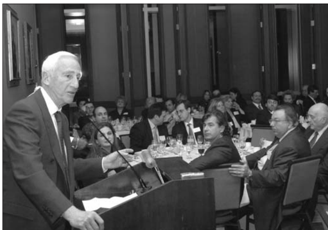
DR. P. ROY VAGELOS, ret. Chairman & CEO of Merck & Co., addressed HACC, Hellenic American Bankers Association and the Hellenic Medical Society of New York on The Changing Pharmaceutical Industry .