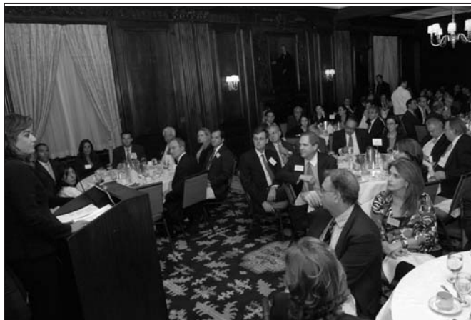
H.E. Dora Bakoyianni, Minister of Foreign Affairs of Greece, addresses members of the Hellenic-American Chamber of Commerce, Hellenic Lawyers Association, Hellenic Medical Society of New York, and the Hellenic Bankers Association at The Harvard Club.