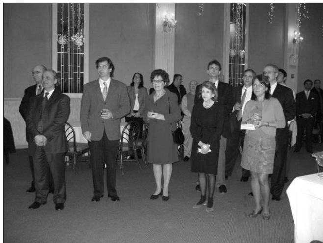
To inaugurate the New Year, members gather for the traditional cutting of the Vasilopita at the Cathedral Ballroom,