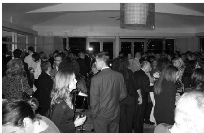
Wine & Food tasting at Battery Gardens Restaurant, featuring wines from Greece and Cyprus, and food samples from top Hellenic restaurants