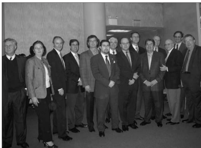
To inaugurate the New Year, members gather for the traditional cutting of the Vasilopita at the Cathedral Ballroom.