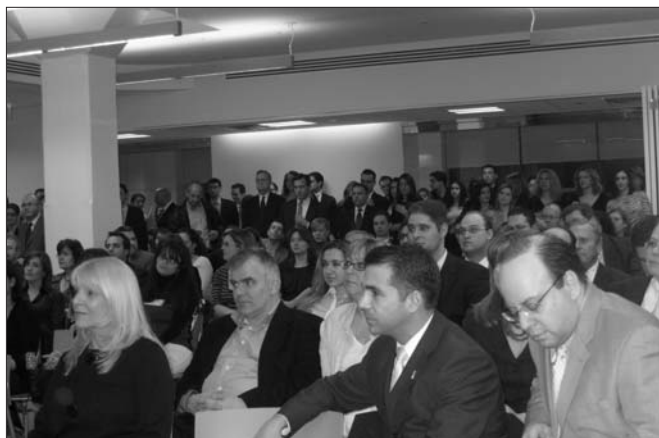
HACC Young Professionals first annual Meet & Greet Reception featuring Mr. John Catsimatidis, at the Greek Press and Communications Office.

June 17, 2008 Our Annual Meeting of Members and Election of Directors took place at Thalassa Restaurant, New York City.