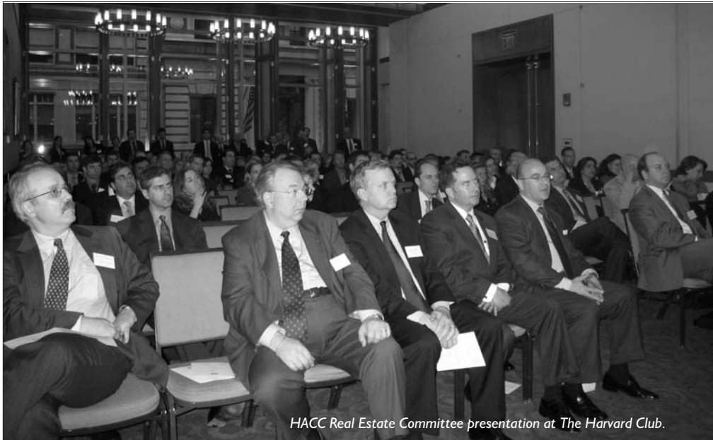
HACC Real Estate Committee presentation at The Harvard Club.