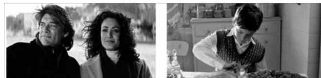
Representative example of screenings in Greek Film Festival New York